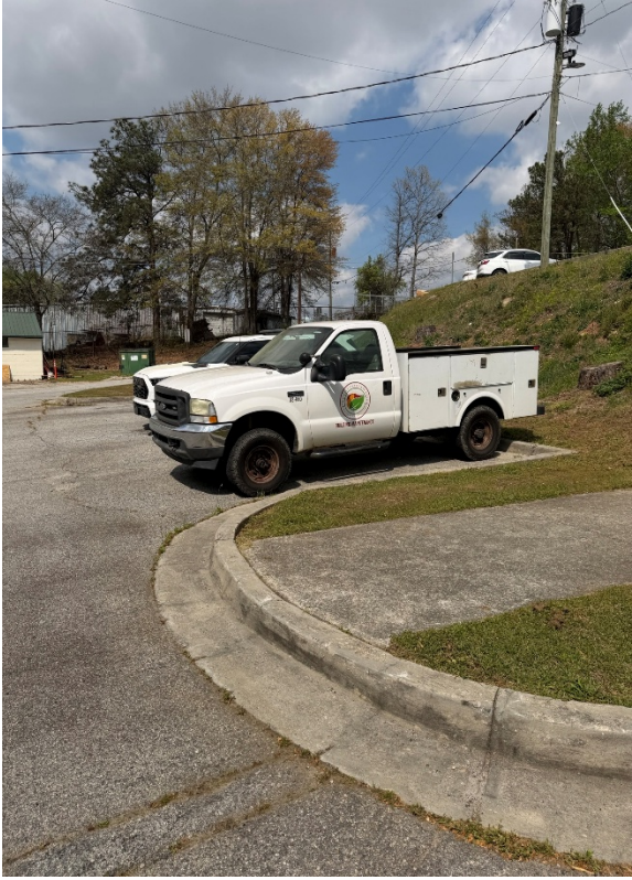
2003 Ford F250