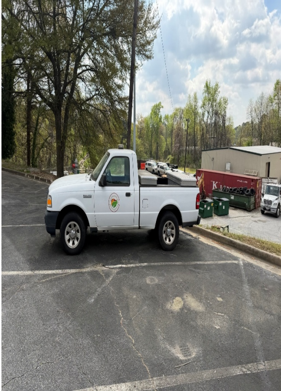
2006 Ford Ranger